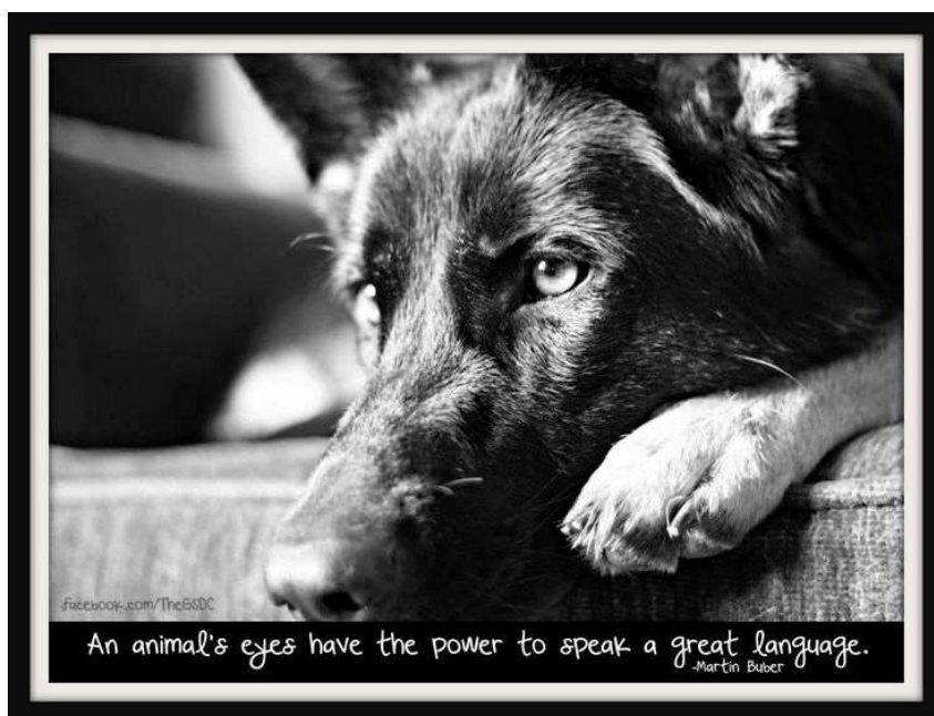
Quote by Martin Buber

There is no doubt that the eyes are the window to the soul, and for animals, it is also their way to connect and communicate in the word around them. It is their own language where they have learned to convey love, sadness, pain, fear, shame, wants and needs. Understanding their eyes, helps us understand their thoughts and feelings which they communicate back to us. By watching their eyes, body movements, and expressions we have learned how to be their advocates